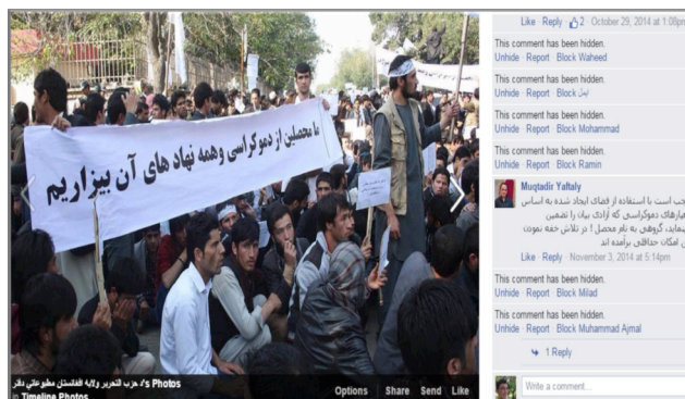
Screenshot 14 - A picture posted by Hizbut-Tahrir on its official Facebook page, showing a gathering of University students condemning democracy with a comment from a moderate social media user saying, 'it is odd to see students using democratic environment to destroy democracy'

Some respondents chose to argue openly with accounts belonging to genuine social media users only. These respondents noted the dangers of responding to anonymous users. For example, criticizing the radical narratives is considered dangerous by one of the teachers interviewed in Jalalabad. Similarly, an academician interviewed in Kabul also avoids replying to the messages posted by people with fake identity but responds to the radical messages posted by people with a verifiable identity. He believes that criticizing anonymous radical posters openly is a huge risk given the fact that it could be anyone living in one's neighborhood. However, a lecturer in Jalalabad claimed that the radical messages are intriguing and argued that some people cannot avoid taking part in discussions in the comments section of posts on Facebook despite the risks involved in doing so.