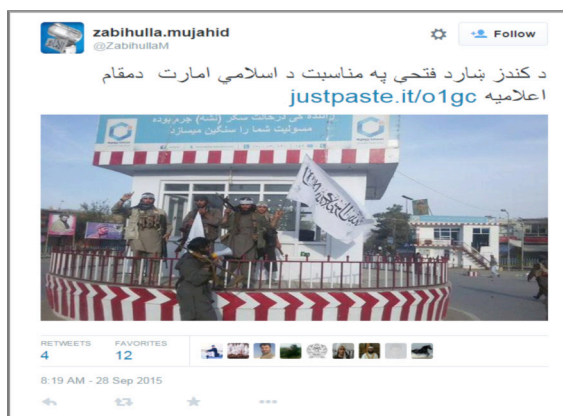
Screenshot 1 - A tweet posted by Zabiullah Mujahid, a Taliban spokesman, about the takeover of Kunduz province by the Taliban

Consequently, it is important to make an important distinction between the goals and motivation of militant organizations and peaceful activists and organizations in their use of social media. The militant groups such as the Taliban use social media as part of their overall political and military strategy, whereas peaceful organizations such as Jamiat-e Eslah use social media as part of their strategy for peaceful social and cultural changes. It was noticed that the militant groups utilize social media for a variety of purposes that includes spreading news of respective political and military campaigns, demoralizing and delegitimizing the Afghan government and other non-state rivals, celebrating jihad