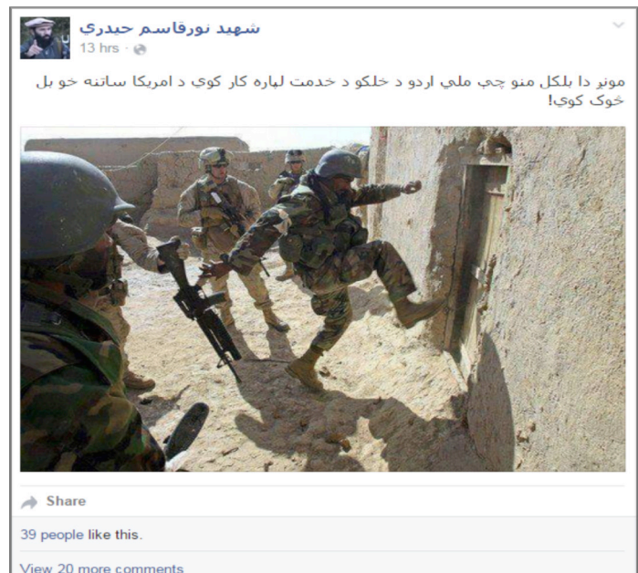
Screenshot 3 - A post by a Taliban sympathizer on Facebook with the message, 'Afghan National Army works for America'

Since, the Taliban and the militant Hizb-e Islami consider the Afghan government as a 'puppet', they also consider those who work for government and collaborators as their enemies. Therefore, they may be justifiably attacked. For example on 4 th of May 2015, the Taliban posted a message on its official Facebook page (next to the pictures of the dead bodies of Afghan security forces apparently killed by the Taliban) stating that "the Islamic Emirate of Taliban calls upon all soldiers and police forces of Afghanistan not to sacrifice themselves for the gloomy cause of Americans. No one should sacrifice themselves to protect some corrupt and puppet figures who own palaces in Dubai, America and other Western countries." 33