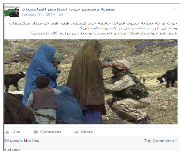
Screenshot 4 - A picture posted by Hizb-e Islami on their official Facebook page with the caption - 'Oh, young people, you are the back bone of your society and you still want the presence of these wild westerners'

"We witnessed the elections [were] being held with fraud and this indicates that occupiers are not able to create a sustainable government. The democratic