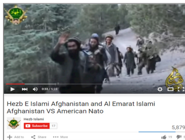
Screenshot 10 - A video posted by Hizb-e Islami on their official You Tube channel, showing the alliance between Taliban ad Hizb-e Islami against the US-led NATO forces in Afghanistan

Despite the significant differences in identification of problems and strategies for action, the Islamic activist groups in Afghanistan share important ideological narratives. The significance of these shared ideological narratives became apparent with the announcement of the death of Mullah Muhammad Omar, the leader of the Taliban at the end of July 2015. Jamiat-e Eslah posted several condolence messages regarding the death of Mullah Omar on its official Facebook page. Similarly, Hizb-e Islami posted a condolence