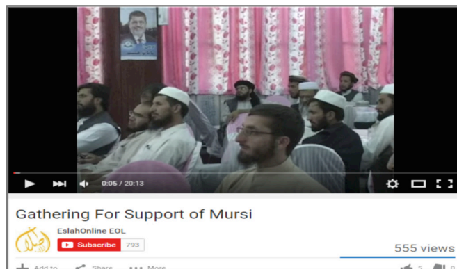
Screenshot 11 - A video posted by Jamiat-e Eslah on their official YouTube channel showing the gathering of sympathizers of Mohammad Mursi, the ousted Egyptian president of Muslim Brotherhood

Transnational Islamic solidarity is an important element of Islamic activist and militant groups. These groups define their identity as part of the broader Muslim Ummah and as a result react to and discuss the political and socio-cultural developments across the Muslim world. Two aspects of their social media commentaries about the Muslim Ummah affairs are worth mentioning: i) an expression of solidarity and sympathy with the Muslim countries that are perceived to be suffering at the hands of Western powers;