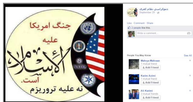
Screenshot 2 - A fake Facebook account named 'Democracy Nizam-e Kufri' (Democracy is an infidel system) claiming the US war on terror is actually against Islam not terrorism

Throughout the research, it became apparent that the militant as well as the non-militant groups extensively use anonymity as a tactic. Anonymous accounts, which were also described by the interviewees as Ja'ali or fake accounts come chiefly in two forms. First, a user creates an account under a common name without posting his or her own photos or any other personal information. Second, many users use generic, vague and unidentifiable titles such as Khwarahn-e Musalman (Muslim Sisters), 27 a Facebook page that spreads Islamic messages with a special focus on its own interpretation of ideal Muslim women. Other such accounts are Tanzim-e Islami Zanan-e Afghanistan (Islamic Organization of Afghan Women) 28 , or Mujahid-e Afghan . 29 Some accounts use titles that have ideological connotations such as Democracy Nezam-e Kofri (Democracy is an infidel system); a Facebook account that seemed to be run by a supporter of Hizbut-Tahrir in Afghanistan. 30 In September 2015, some Afghan politicians claimed that foreign elements were manipulating Afghan national interests. One senator claimed that 8,000 fake accounts are active on social media and are promoting division, and ethnic and sectarian conflict in Afghanistan. 31