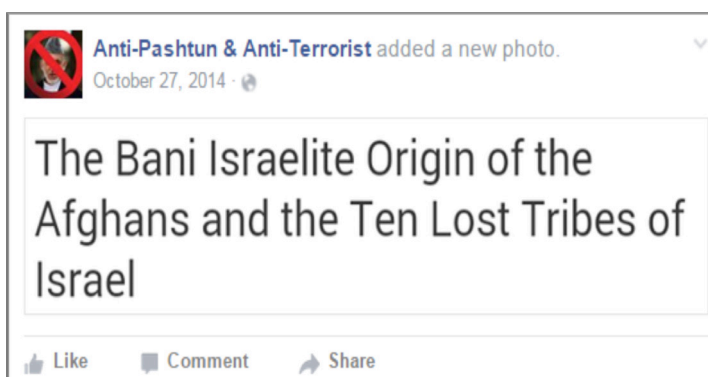
Screenshot 13 - A fake Facebook account spreading ethnic hatred against the Pashtuns by comparing them with terrorists

A civil society activist interviewed in Mazar claimed that the radical groups mix-up religion and ethnicity. He described messages against Pashtuns labeling them as suicide bombers while members of other ethnic groups are blamed by some for being too liberal, or even for converting people to Christianity. Another civil society activist interviewed in Mazar claimed that in order to spread hatred among different ethnic groups, radical groups upload photo-shopped images to show certain ethnic groups in a bad light. Some respondents belonging to Shia Hazara community claimed that their community is specifically targeted.