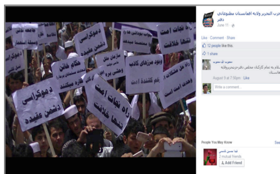
Screenshot 8 - A picture posted by Hizbut-Tahrir on its official Facebook page, showing a gathering of sympathizers condemning democracy and calling for the establishment of Islamic state

However, the Islamic activist groups are also keen to emphasize the rights of women within the framework of Sharia law. In a press release posted on its official Facebook page on 6 th of May 2015, the Taliban emphasized that “concerning women, [the Islamic Emirate] is fully committed to respect all women’s rights under the auspices of the sacred religion of Islam. In Islam, women have the right to choose whom to get married to, right to inheritance and have the right to study and work. The Islamic Emirate will respect these women’s rights in a way that ensures their legitimate rights, human dignity and their Islamic status.” Likewise, Hizbut-Tahrir promises an Islamic Khilafah in which the women can achieve all their rights according to Sharia law. In March 2015, the organization published an article on its official Facebook page, titled “Women Under the Ottoman Khilafah: “Challenging the Myths of Women and Their Economic Rights.” The article argues that “the general picture derived from various records of the Ottoman Caliphate shows that the women were active in various economic fields, including the agricultural work and all kinds of handicraft works, such as: spinning, knitting and weaving. They would sell their products in the market places, manage other financial issues, lend money, enter into contracts, run businesses, organizations and foundations, be an employer or employee, and engage in various other economic activities.” 48