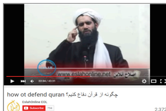
Screenshot 5 - A video clip posted by Jamiat-e Eslah on their official YouTube channel, in which a prominent religious scholar and a member of the organization explains his views on the interaction with non-Muslims

"Have faith and do not complain about your enemies that why they burnt the Quran? Why the enemy insulted me or why the enemy insulted Prophet Muhammad? You must understand that we cannot expect good from the enemy. ... Our enemies consider Islam as their adversary but unfortunately there are some Muslims or so called Muslims who try to make peace with them. They try to introduce our enemies as our friends and force us to have interaction with them. I want to make it clear that those who are not Muslims are our enemies and we should deal with them accordingly." 42