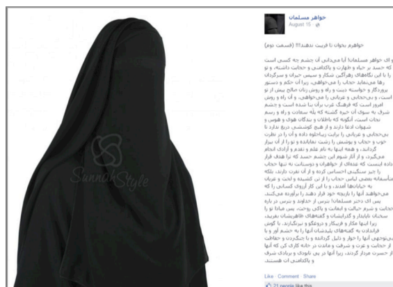
Screenshot 7 - A picture of a woman posted by a fake Facebook user, illustrating how Muslim women should dress

Sometimes, such socio-cultural concerns are also expressed against some of the activities of civil society activists. For example, on 6 th of March 2015, a group of male activists attempted to attract public attention by appearing in a group wearing chadari in the center of Kabul. The idea was to mark a symbolic protest to highlight the lack of freedom for Afghan women and the complications of wearing hijab. The move elicited strong condemnation from most of the prominent Islamic groups, including the Taliban, Hizb-e Islami and Jamiat-e Eslah. What is striking is that in their opposition to perceived liberalization, these groups deploy the same terms that they use to demonize and delegitimize the Afghan government and foreign forces. For example, in reaction to this symbolic protest, Hizb-e Islami posted an article on its official Facebook page, titled: "Why Kuffar and Hypocrites Consider Chadari as Coercion"? Referring to the group of civil society activists, the article argued that "a satanic group insulted Islamic hijab as they claimed that chadari is being imposed on women, but in reality chadari is a perfect hijab for women as it includes every characteristic of hijab and is meant to safeguard the dignity and honor of women." 46